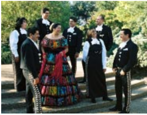
The Mariachi band “Mariachi Los Gallitos” will perform during the Doctors Orchestra concert at the Cullen Theater, Wortham Center, Feb. 13.

Come hear Doctors Orchestra of Houston, now in its fifth season, in its Valentine Day concert celebration, “Love is in the Air,” 5 p.m. Sun., Feb. 13 , Cullen Theater, Wortham Center.