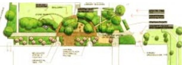
Architect's rendering of Webber Plaza

"The work was to start the following Monday after Parking Lot A was closed," Walkup said. "And it's been suggested that we reopen the parking lot in the interim; however, we hope to have the berm project started up in 30 days, which would mean we would have to clear it again, plus all of the access controls to the lot have been removed."