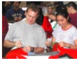
Medical students stitch Christmas stockings for Memorial Hermann Hospital's December babies (Scoop 11/14/03).