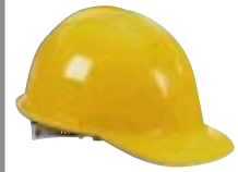
Medical School faculty, students, and staff attended a Hard Hat Happening in the Leather Lounge to celebrate the beginning of ground floor construction.