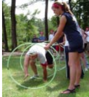
Scene from the Student Retreat, Camp Allen (Scoop 8/22/03).