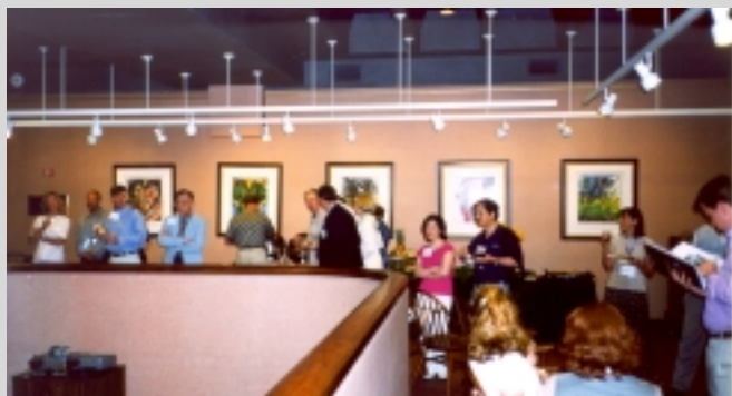
Participants gathered at the Alumni Reunion reception.

The Alumni Reunion, coordinated by the Office of Alumni Affairs, took place April 26 and 27. Approximately 120 people were in attendance at each of the various events. Classes participating were: the graduating classes of 1977, 1982, 1992, and 1997.