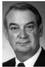
Dr. Ferid Murad